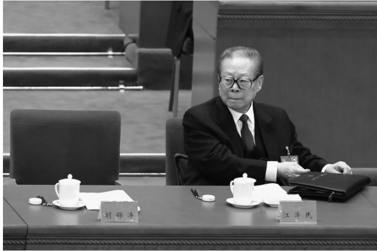
Former Chinese leader Jiang Zemin attends the 18th Communist Party Congress in Beijing on Nov. 14, 2012.

Spiritual practices such as Falun Gong, which besides its moral teachings incorporates gentle exercises and meditation, benefit the country and the people. Even the CCP's own constitution and laws don't prohibit one from practicing Falun Gong.