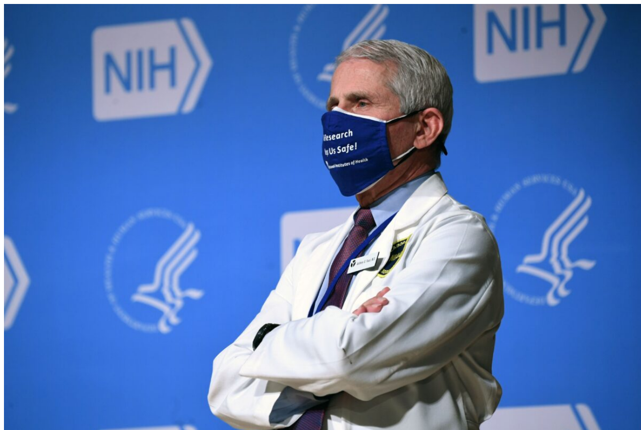
NIAID director Dr. Anthony Fauci listens to President Joe Biden (out

Fauci recently told The New York Times: “I have stated repeatedly that we must keep an open mind as to the origins of the virus, and that the origin of the virus should be the subject of ongoing, thorough and open-minded scientific study that follows the data and evidence wherever it leads.” This claim is demonstrably incorrect. For instance, on Feb. 9, 2020, Fauci told former House Speaker Newt Gingrich: “Well, I think ultimately, we know that these things come from an animal reservoir. I’ve heard these conspiracy theories and like all conspiracy theories, Newt, they’re just conspiracy theories.”