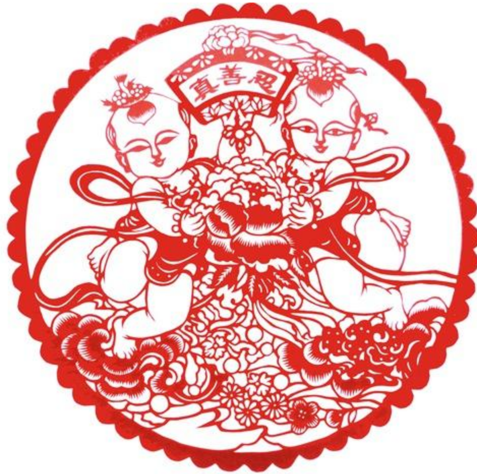
Category: Dafa Day Art Designs