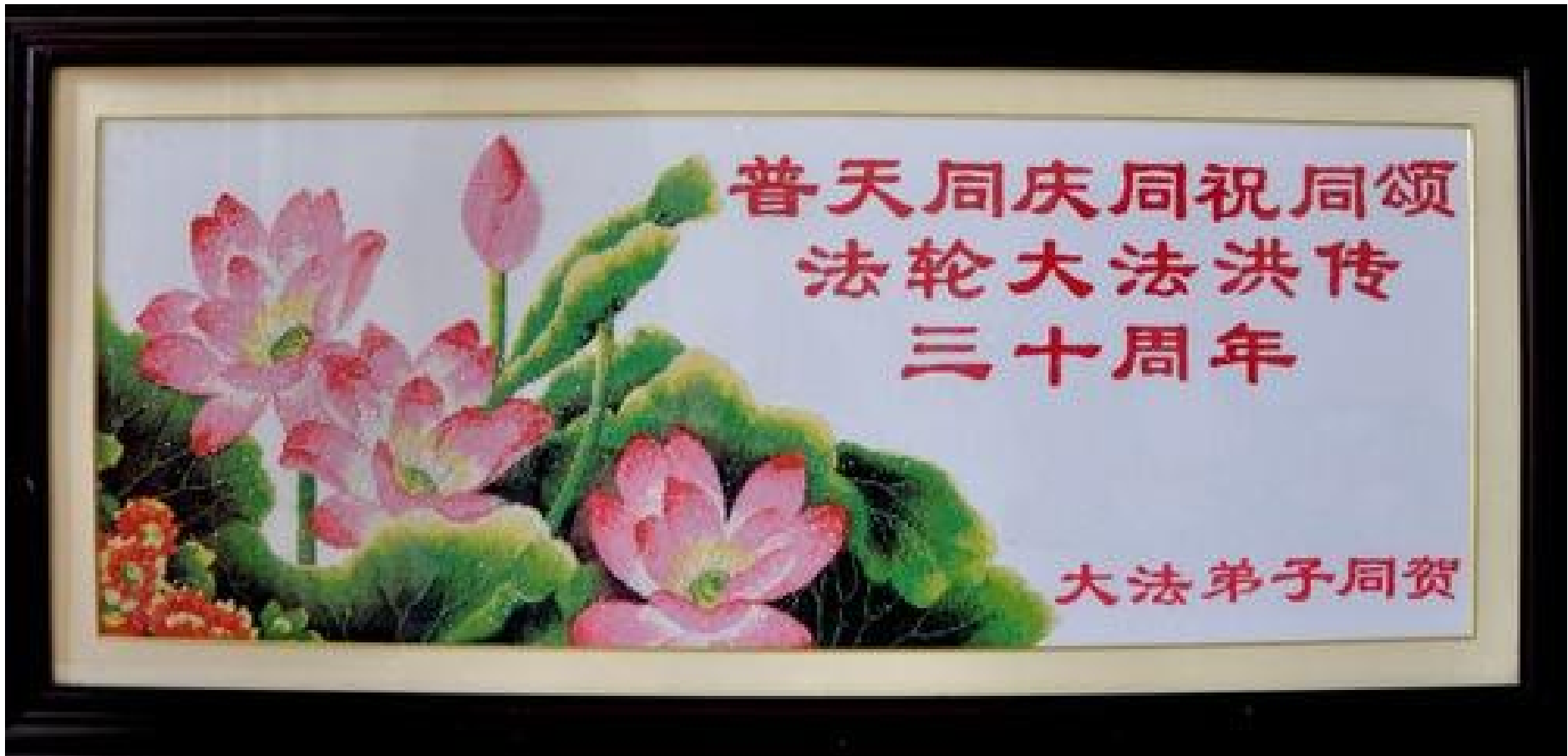
The embroidered message in the image is: "The whole universe celebrates and rejoices at the 30 th anniversary of Falun Dafa's introduction to the world."