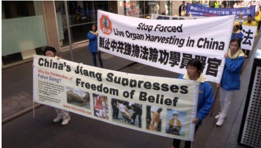
Falun Dafa practitioners are holding banners raising awareness about forced organ harvesting and bringing Jiang Zemin to justice, in Melbourne, Australia, on July 14, 2018.