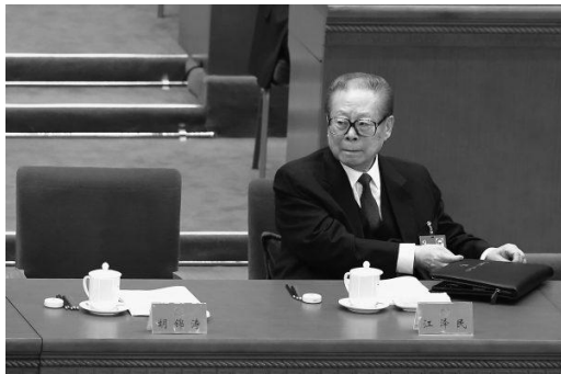
Former Chinese leader Jiang Zemin attends the 18th Communist Party Congress in Beijing on Nov. 14, 2012.

In July 1999, however, when there were an estimated 100 million Chinese practicing Falun Gong across the country, out of his jealousy of its popularity, Jiang launched a vicious persecution of the group, while disregarding the aspirations of the public and general opposition of officials at all levels, including that of the six Politburo Standing Committee members.