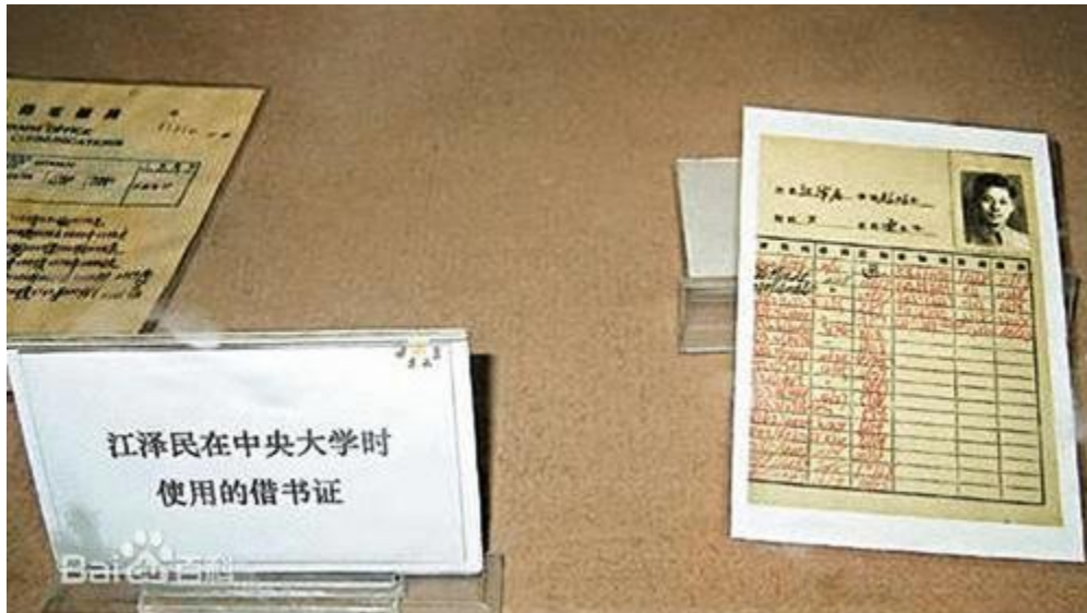
Library card of Jiang Zemin at Nanjing Central University

This was confirmed by Nanjing University’s archive department after Jiang became the top leader in 1989. Although the university contacted Jiang at the time to resume the connection, they never heard back – Jiang always avoided that part of history involving his traitorous record.