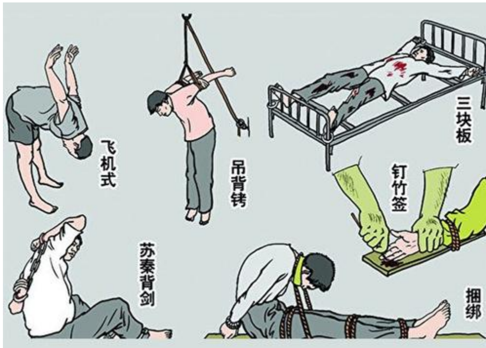
Types of torture

Practitioners in detention were often tortured. "If you don't give up [practicing Falun Gong], we will burn you up [cremate you]!" some police yelled at the practitioners they were torturing.